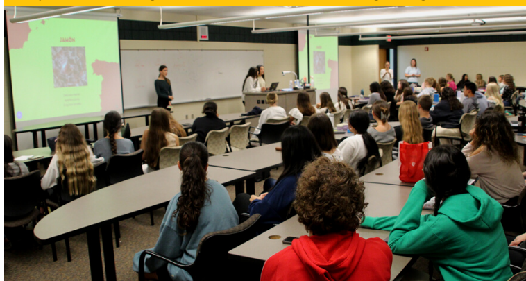
Students from Granada presented slideshows to our Hamilton High School Spanish students on August 29 to teach them different things about Spain!