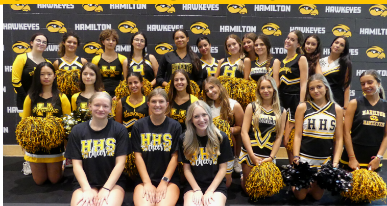
Hamilton cheerleaders pose for a photo with the students from Granada, Spain after teaching them about American Cheerleading on August 24.

To say the Hamilton students are looking forward to their time in Spain this coming June would be an understatement. While there, they will get to experience the same hospitality that the Hamilton community has shown the Spanish students. They will grow their minds, their experiences, and their bonds that will truly last a lifetime.